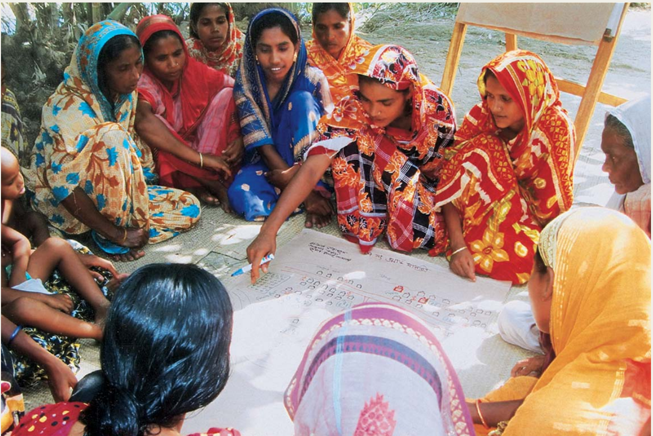
Mapping exercise with representatives of the community.