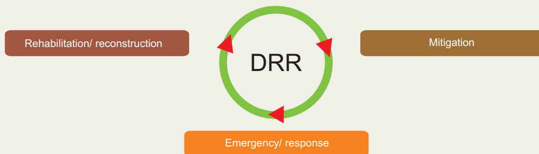
Figure 1: DRR should be seen as a cycle and not as a single intervention.

“Natural” disasters are not purely the result of natural events, but are the product of the social, environmental, political and economic context in which they occur. Addressing DRR through a livelihood approach, vulnerability and capacity can be analysed according to the six different livelihood assets – natural, physical, social, human, financial and political. These assets together determine people's resilience. 4 Resilience is very specific to the community, to households and indeed to individual women and men.